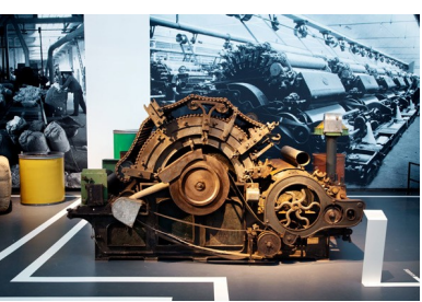
Tim - Staatliches Textil- und Industriemuseum (Augsburg, Germany), LMA 2011 Winner