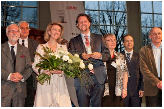
Luigi Micheletti Award ceremony at DASA (Dortmund, 2011)

The completed application form to be accompanied by <u>two copies</u> of a CD which should include: