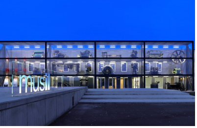
mus il – Museum of Industry and Labour (Brescia, Italy)