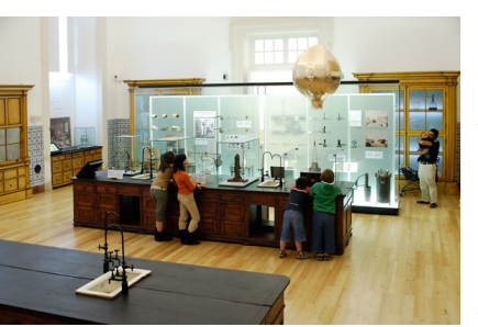
Museu da Ciência (Coimbra, Portugal), LMA 2008 Winner

and its scientific, industrial and social heritage. You may apply if you are a museum of 20th century history (social, political, military), a museum of science, technology or industry, a science centre, an ecomuseum or an interpretation centre on these subjects.