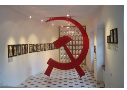
Idrija Municipal Museum (Idrija, Slovenia), LMA 1997 Winner